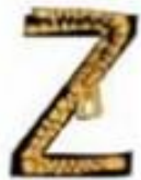
Zig, zag, zig