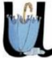
Down and under the umbrella, up to the top and down to the puddle