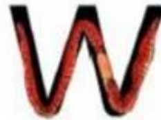
Down up, down up