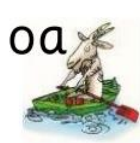
Goat in a boat