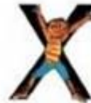
Down the arm and leg, repeat the other side