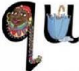
The queen never goes out without her umbrella