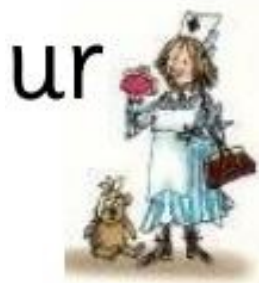
Nurse with a purse