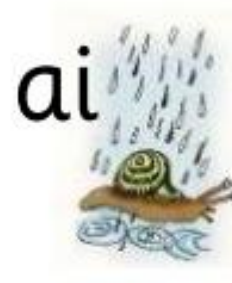
Snail in the rain