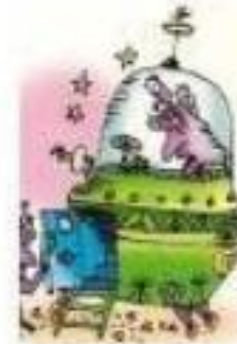
Start the car