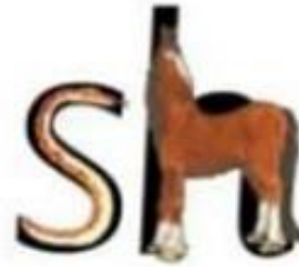
sh says the horse to the hissing snake