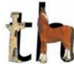
The princess in the tower is saved by the horse, thank you!