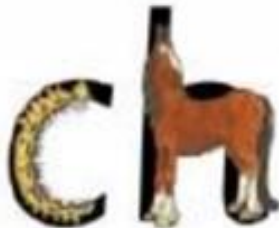
The horse sneezes when the caterpillars hairs get up his nose shukshon