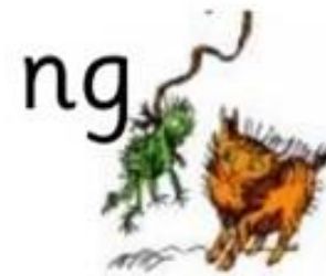
Thing on a string