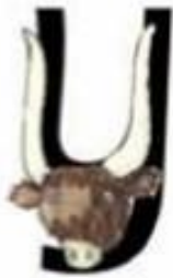
Down a horn, up a horn and under the yak's head