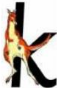
Down the kangaroo's body curl his tail and leg