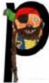
Down the pirates plait and around the pirates face