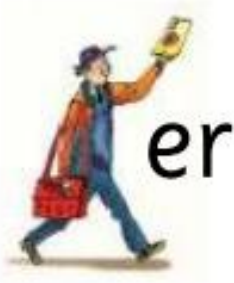
A better letter