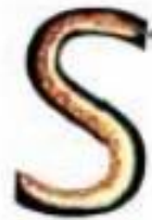
Slither down the snake