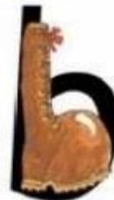
Down the laces, over the toe and to the heel