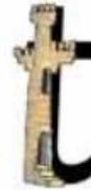
Down the tower, across the tower