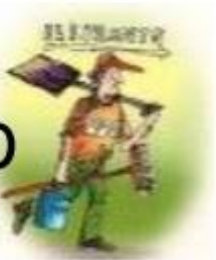
Poo at the zoo