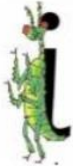
Down the insects body and a dot for his head.