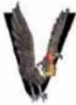
Down the wing up the wing