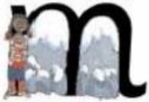
Maisie, mountain, mountain