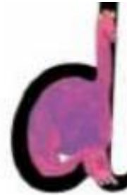
Around the dinosaurs bottom and up to his neck