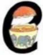
Slice into the egg, go over the top, then under the egg.