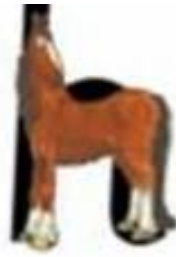
Down the horses head to his hooves and over his back