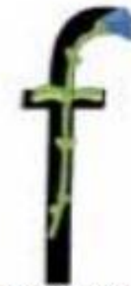
Down the stem and draw the leaves