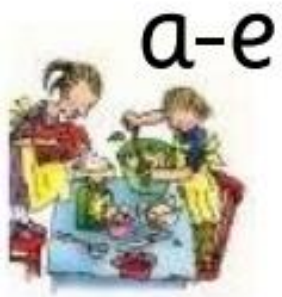
Make a cake