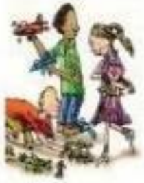
May I play?