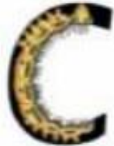
Curl around the caterpillar