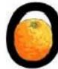
All around the orange