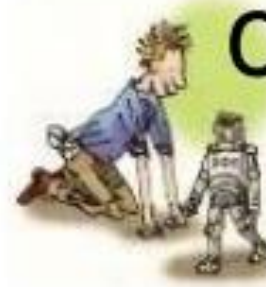
Shout it out