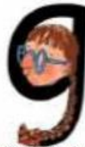
Round the girls face, down her hair and give her a curl