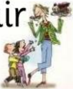
That's not fair